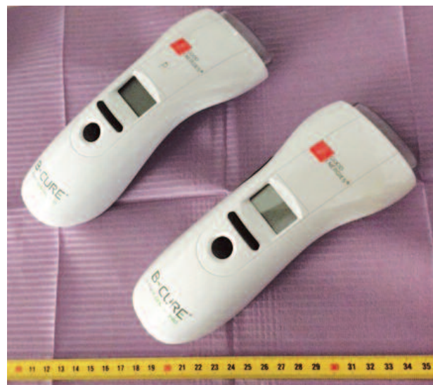
Figure 2: Devices used blindly by the patients: treatment device and placebo device.

In a recent study, Kobayashi et al 25 ) hypothesized that one of the pain relief mechanisms when